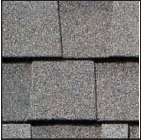
Olde English Pewter