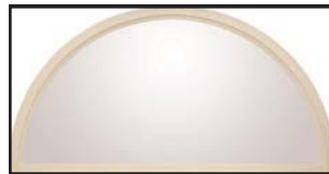
Half Round Transom Clear or Grilles 3/0 - 37 1/2" Sidelight Units 1/0-3/0-1/0 - 64 1/2" x 33 1/4" 1/2-3/0-1/2 - 68 1/2" x 34 3/4"