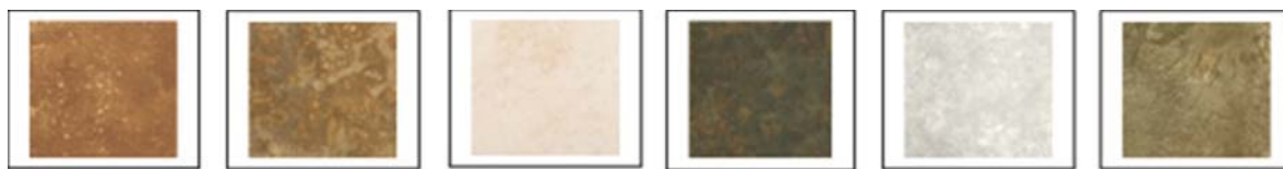
Rosso w/Almond Grout