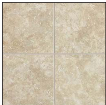
White Rock HL01

HEATHLAND SERIES OPTIONAL UPGRADE 12 X 12 FLOOR OR 6 X 6 WALL