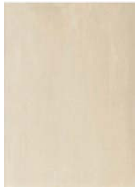
Off White SY95