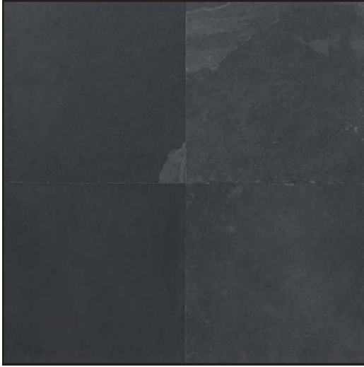
Brazil Black S762