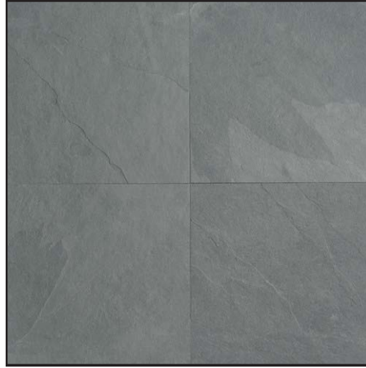
Brazil Grey S201