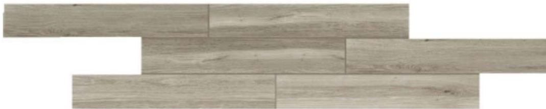
Gravel Road SD16 w/19-Pewter Grout