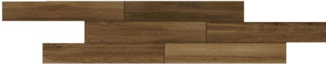
Walnut Creek SD15 w/52-Tobacco Brown Grout