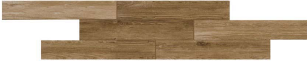
Farmhouse SD14 w/145-Light Smoke Grout