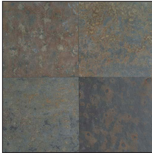
Brazil Multicolor S275

Due to variation in computer monitors and printers, the color samples seen here may not exactly match the corresponding color.