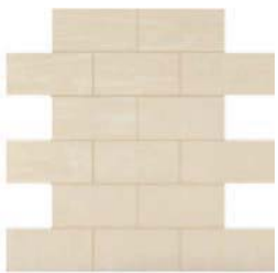
Off White SY95